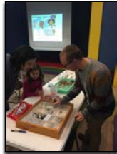
Activities for families at the Discovery Science Place