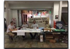
Darwin Day booth at UT-Tyler