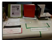
Display at UT Tyler's Muntz Library