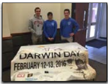
Darwin Day booth at the Center for Earth & Space Science Exploration