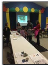
Activities for families at the Discovery Science Place