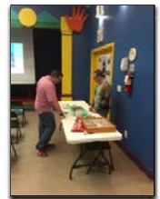
Activities for families at the Discovery Science Place