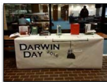
Display at UT Tyler's Muntz Library