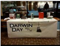
Display at UTTyler's Muntz Library Available till 13 Feb.