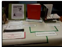
Display at UTTyler's Muntz Library Available till 13 Feb.